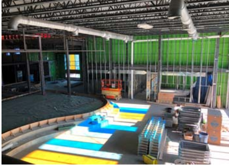
Cafeteria & DaVinci Studio Colour projected from window wall