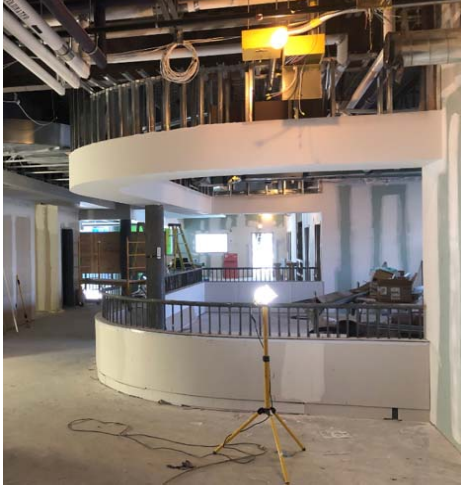
Library 2nd floor of 2 storey space